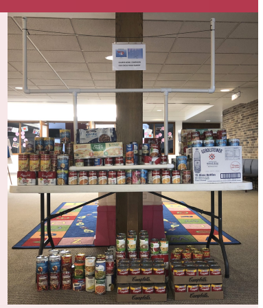
2019 Souper Bowl

It is almost here!! We can't wait for the Souper Bowl Competition. Ascension is in the game. For the sixth year in a row, Mission Outreach is sponsoring the famous Ascension Souper Bowl Competition for the month of February beginning on Souper Bowl Sunday February 2. During the entire month of February, we will receive donations of cans of soup for the Cross Food Pantry. We invite individuals, families, small groups, committees, Sunday School classes, to sign on for the challenge. We will post progress on the Mission Outreach Facebook page and announce the winner at the end of the month. Remember that every week, 200+ people from the Cross neighborhood visit the Cross Food Pantry, so if we collect 200 cans, we provide one can of soup for each recipient for one week. Cross Milwaukee is our local partnership church and we work along side them in doing ministry to their neighborhood. Let's see how many weeks of soup we can supply! What a fun way to help those in need!