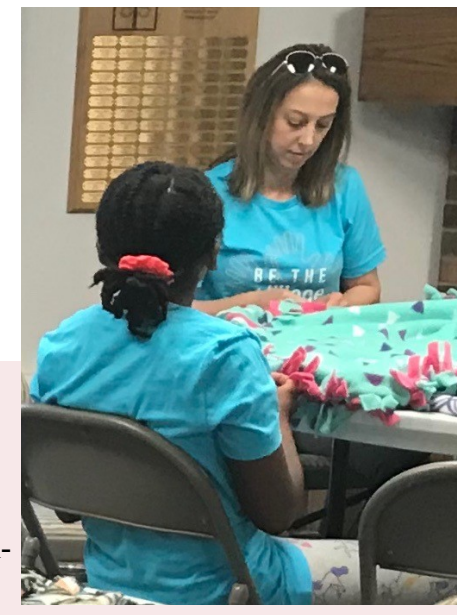
Be the Village Talk 'n' Tie