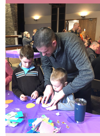
2019 Road to the Cross