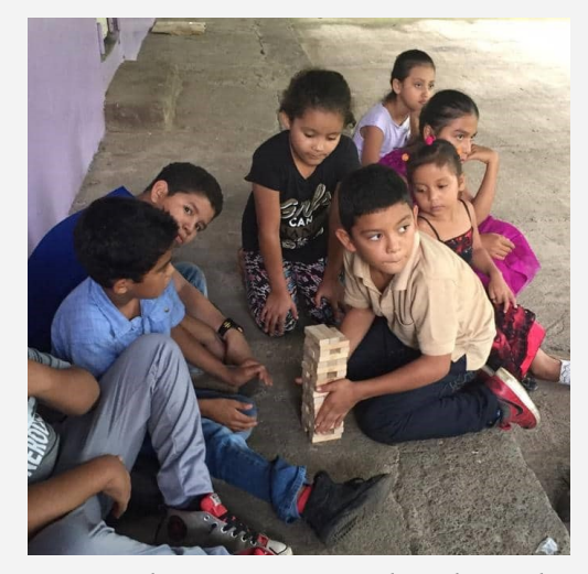
In November, San Jorge Church in El Salvador hosted a Children's Education Day using games and books gifted from Ascension. Gracias Ascension!