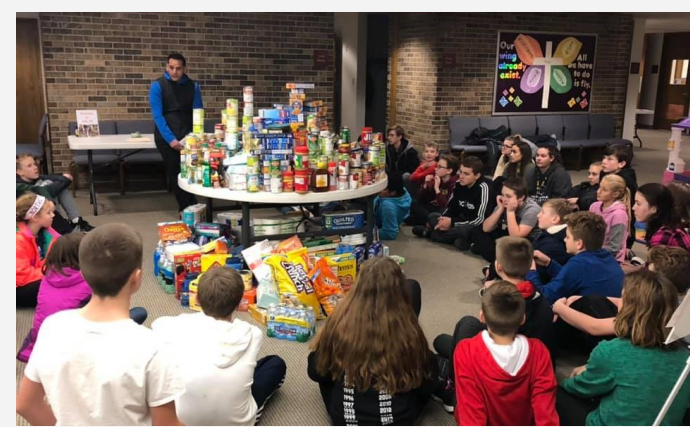
JOLT Mystery Trip to Meijer for Food Pantry shopping