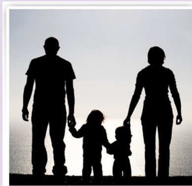
Foster/Adoption Meetings March 3, April 14, May 5 (between services)

"Do you not know that your body is a temple of the Holy Spirit within you, which you have from God, and that you are not your own? For you were bought with a price; therefore glorify God in your body."