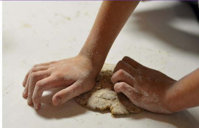
The first communion classes include bread-making.

The First Communion Stepping Stone will occur on three Sunday mornings: March 10 and 17, and April 7. The courses, for students in fourth grade along with a parent/guardian, take place in East and West Halls during BLAST. The Rite of First Communion will be celebrated at the 8:30 and 10:45 a.m. worship services on Palm Sunday, April 14, and Sunday, April 28. The sacrament of Holy Communion is a tangible reminder of God's great love for us, and these Stepping Stones classes are an important time of faith-building and conversation on this journey.