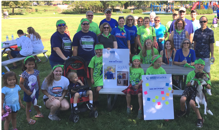
Ascension at the NAMI Walk, Sept. 2018

NAMI, National Alliance on Mental Illness, is a valuable part of our community. NAMI Waukesha provides hope and help to those impacted by mental health conditions. NAMI offers educational classes, a variety of support groups and community education. All services are free of charge. The mission of NAMI Waukesha is “to inspire the hope of recovery and deepen the understanding of mental health conditions for individuals, families and communities.”