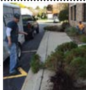
Property Day 2015