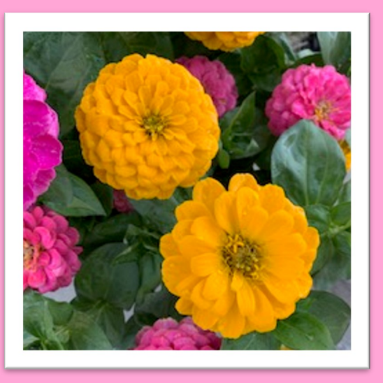
5th Sunday of Easter Sunday, May 10, 2020