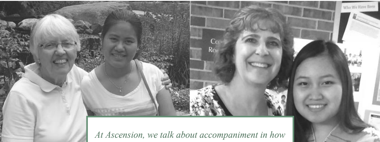
At Ascension, we talk about accompaniment in how we do mission work. It is the guiding force in how we define what we do and how we work together.

At Ascension, we talk about accompaniment in how we do mission work. It is the guiding force in how we define what we do and how we work together. If you would like more information on accompaniment and its base in Scripture, it isn’t too late to go to Outreach for Hope’s website and read the devotions for this Lenten season. You will be blessed by each day’s thoughts on how we can truly walk with Jesus by walking with our neighbors both near and far. If you find the devotions a blessing, please consider making a donation to Outreach for Hope to help in the ministries they do within the Greater Milwaukee Synod to walk with those who are most vulnerable.