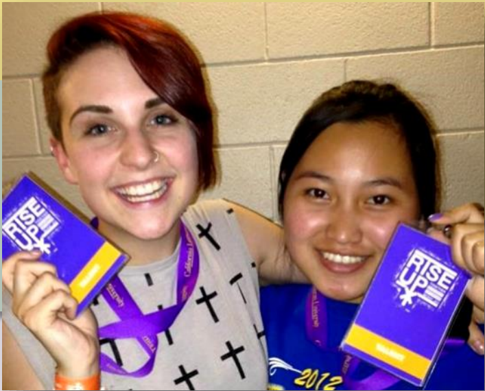
Ascension participants in the 2015 ELCA Youth Gathering