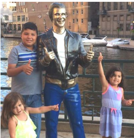
Having fun during the El Salvador delegation visit.