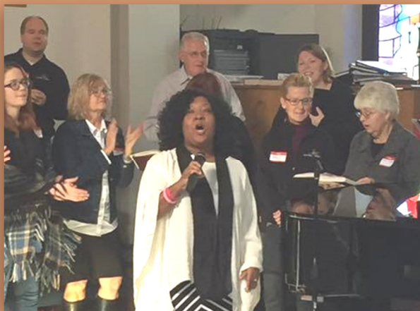
Cross Partnership Sunday