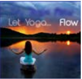
Let Yoga... Flow

We have updated our AED (Automatic Electronic Defibrillator). It is located in the sanctuary in a cabinet with a new AED sign. Please take note of it the next time you are in the sanctuary. The interval from collapse to defibrillation is one of the most important determinants of survival from sudden cardiac arrest. AEDs are computerized devices that identify cardiac rhythms that need a shock and can then deliver the shock. AEDs are simple to operate, allowing anyone to attempt defibrillation safely. In case of an emergency, if someone collapses, always call 911 first and then grab the AED. Turn it on and follow the verbal prompts. The new defibrillator is completely automatic and very user friendly. Both adult pads and child pads (infant-8 years-old) are available along with CPR barrier and instructions in the cabinet. It is my hope that we never need to use this equipment, but at least we have it available in an emergency.