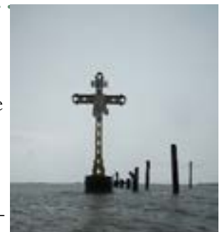
Hurricane Katrina Memorial St. Bernard Parish