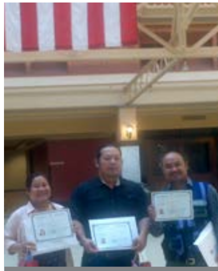
Proud new U.S. citizens!