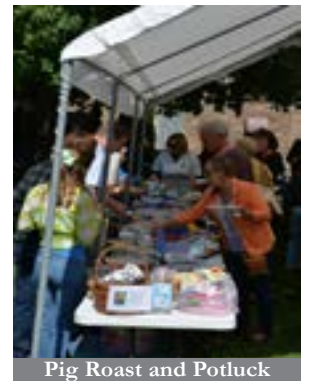
Pig Roast and Potluck