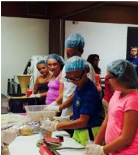
Students got acquainted as they worked.