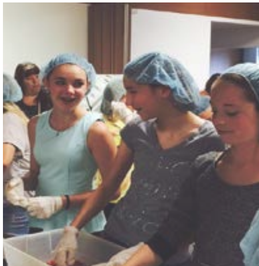
Team work, servanthood, and fellowship