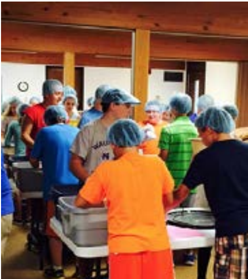
Students worked in teams to pack food.

As part of orientation, students and their parents took part in a food pack service learning project to benefit our brothers and sisters in El Salvador. Great job!