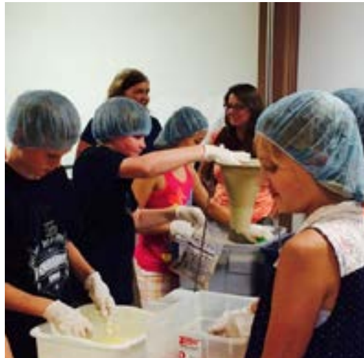
They poured, measured, weighed, and sealed bags of food.