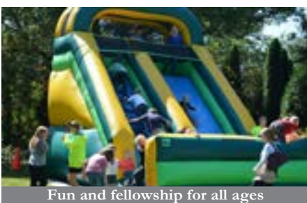
Fun and fellowship for all ages