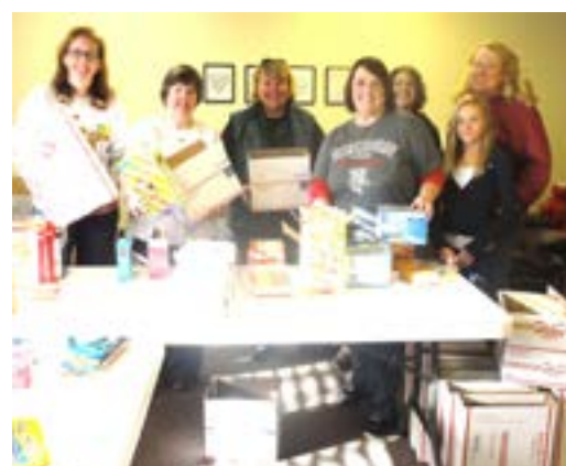
College care packages assembly